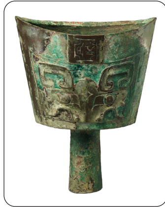
bronze nao (bell)