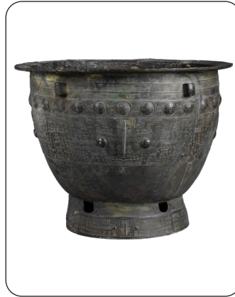
bronze yu (ritual container)