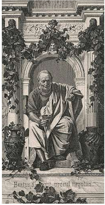
Anton von Werner, Public domain, via Wikimedia Commons

A work of art is above all an adventure of the mind.