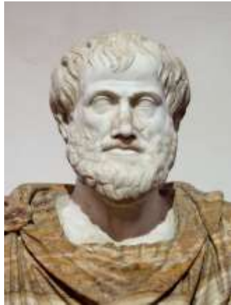
After Lysippos, Public domain, via Wikimedia Commons